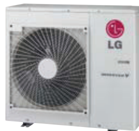
Quad-Zone Multi F