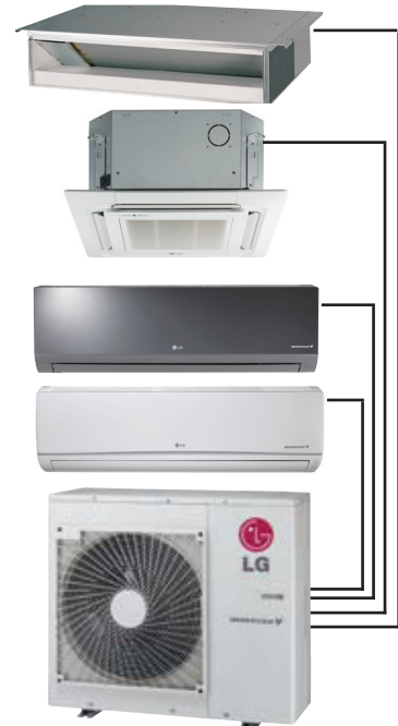
Figure 3: Quad-Zone (LMU303HV and LMU363HV) Multi F Heat Pump Inverter System — Mix and match for 14,000-40,000 (LMU303HV) and 14,000-48,000 Btu/h (LMU363HV).