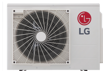
Dual and Tri-Zone Multi F