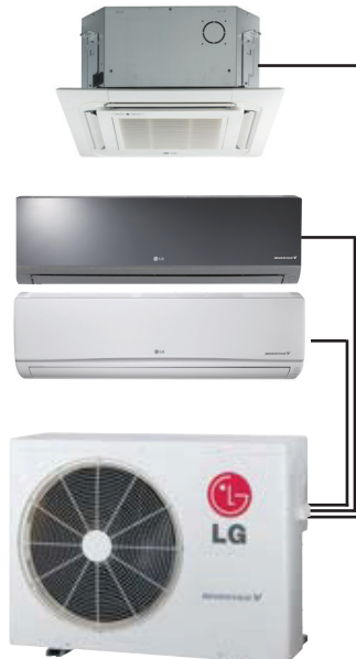
Figure 2: Tri-Zone (LMU243HV) Multi F Heat Pump Inverter System — Mix and match for 14,000-33,000 Btu/h..