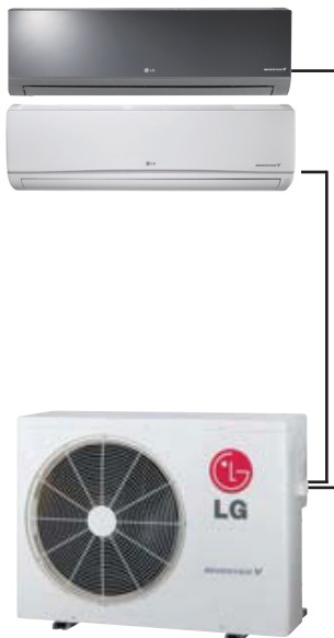
Figure 1: Dual-Zone (LMU183HV) Multi F Heat Pump Inverter System — Mix and match for 14,000-24,000 Btu/h.