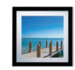
Art Cool Gallery