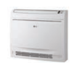
Low Wall Console